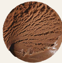
Chocolate lactose free