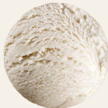
Vanilla lactose free